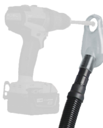
BitBuddie® for Drills (D1900/D1905/D1908)