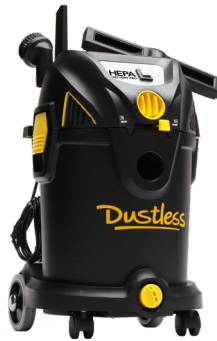
HEPA Wet+Dry PRO DustlessVac® (D1619)