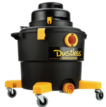
Wet+Dry DustlessVac® (D1603)

*For general jobsite clean-up and vacuuming drill holes, a HEPA vacuum is required.