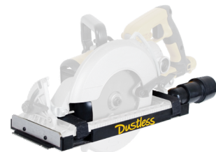
DustBuddie® for Worm Drive Saws (D4000)

NOTE: For most jobs, OSHA requires personal respiratory protection of APF 10 - 25 (regardless of dust control systems). See your safety equipment supplier for information on the correct respiratory protection.