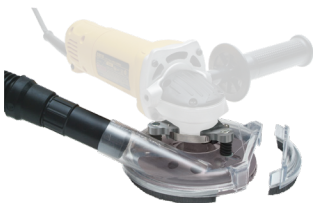
DustBuddie® for Hand Grinders (D1835/D1850)

A commercially available dust collection shroud attached to the worker's tool.