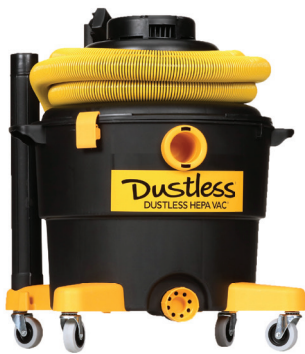
HEPA Wet+Dry DustlessVac® (D1606)