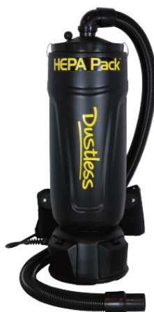
Model No. D1505

We're proud to announce the release of our new HEPA Backpack Vacuum! This is a replacement for our yellow version, 15505. This versatile vac allows the user to easily climb ladders, fit in small spaces, and be OSHA Compliant. With lighter weight, increased durability and added filtration, you'll find this vac is ideal for your needs.