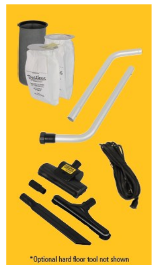
*Optional hard floor tool not shown