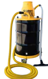
Slurry Vac System (H0904)