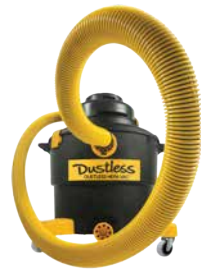
HEPA Wet+Dry Dustless Vac® (D1606)

ALL LISTED PRODUCTS ARE 60% AMERICAN MADE OR MORE