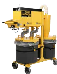
DustDroid 600 Dustless Vac® (H0601)