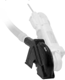
CutBuddie® LT for Hand Grinders (D0730)