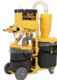
DustDroid 300 Dustless Vac® (H0302)