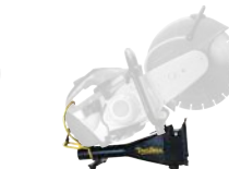
DustBull for Hardscaping (D1765)

1285 East 650 South, Price, Utah 84501 800.568.3949 sales@dustlesstools.com www.dustlesstools.com