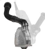
CutBuddie® (5") for Hand Grinders (D1730)