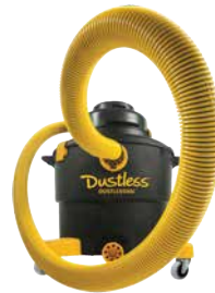
Wet+Dry Dustless Vac® (D1603)