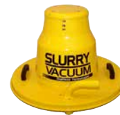
Slurry Vac Vacuum Topper (H0901)