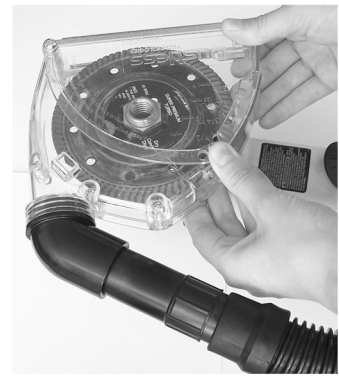
Adjust the depth of the 6. CutBuddie as needed by pushing down on the tab located on the side.

WARNING! If using this product in the removal of lead paint, asbestos, or other hazardous materials, a Dustless HEPA vacuum must be used. The removal of said materials may generate dust or fumes. Exposure to said materials may cause brain damage or other adverse health effects, especially in young children and pregnant women. Follow all federal, state and local laws including the U.S. Environmental Protection Agency's Renovation, Repair and Painting law or similar law.