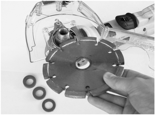
Install wheel. Insert appropoiate spacers to adjust • /center wheel in the shroud for best performance. Make sure cut wheel is seated flat.