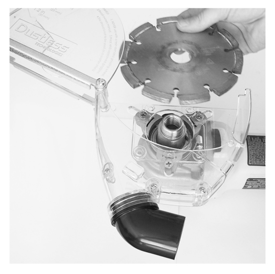
Follow Installation steps and install tuckpointing wheel.