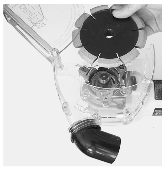
Follow Installation steps and install crack chasing wheel.