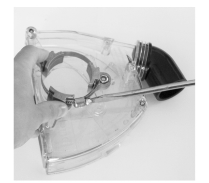
Loosen band clamp.