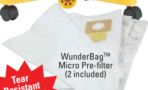
WunderBag™ Micro Pre-filter (2 included)

Tear Resistant Retains Strength When Wet