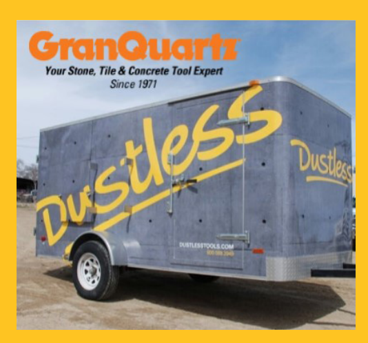
Here at Dustless, we love supporting our dealers and meeting with our end users! Our sales reps can attend customer appreciation events, such as this one pictured by GranQuartz in Salt Lake City, Utah.